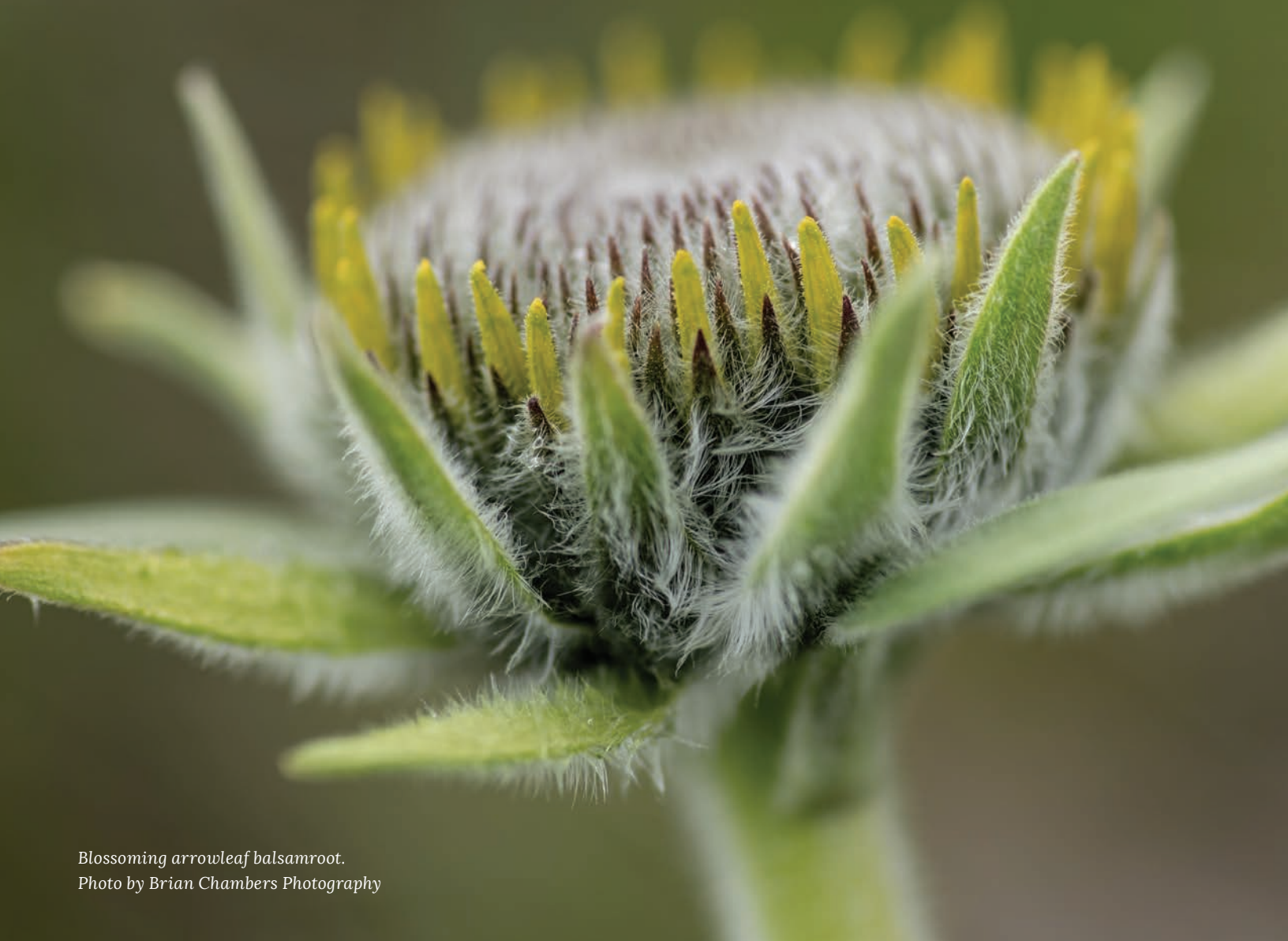
Blossoming arrowleaf balsamroot.